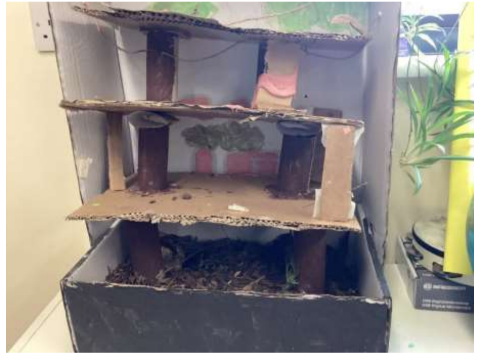
In Osprey Class, the children have been looking at The Highway Man and have worked as a class to produce a great performance of the poem which included a sound scape to enhance their dramatic piece. Year 5 finished their wonderful moving toys, they are amazing!